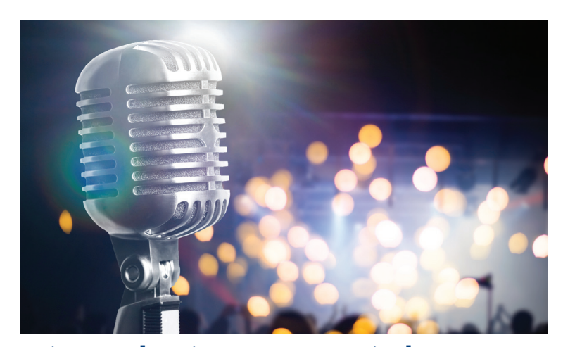
"Tina" - The Tina Turner Musical

Visit realid.ilsos.gov for more details and a list of documents needed to apply for a Real ID driver's license or state ID card.